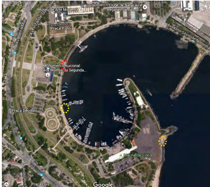
Teixeira de Freitas Gallery