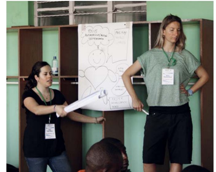
The five attending NPCs signed a Memorandum of Understanding to strengthen the Paralympic Movement in Southern Africa.

In October the IPC held a Regional Training Camp in Lusaka, Zambia for 23 athletes, 10 coaches and five administrators from Zambia, Lesotho, Namibia, Botswana and Zimbabwe. Funded by the Norwegian Olympic and Paralympic Committee and Confederation of Sports (NIF), as well as Charity in Sport, the camp identified talent, made use of sport as a tool for personal development and provided a platform for NPCs to share knowledge. The newly elected Sports Minister attended the opening ceremony and outlined his support for the Paralympic Movement.